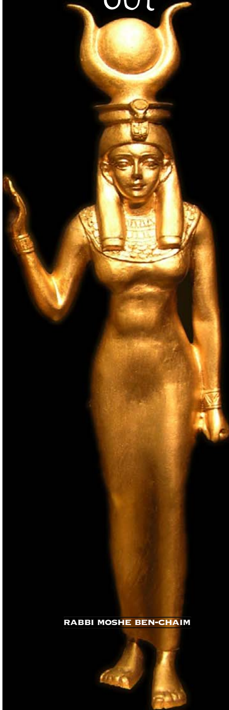
RABBI MOSHE BEN-CHAIM

The purpose of the Ten Plagues was not to destroy Egypt, but to offer the primary lesson to that idolatrous culture: “The God of creation and of Abraham is the only God...and Egyptian deities are imaginations.” God desires the good for all mankind.