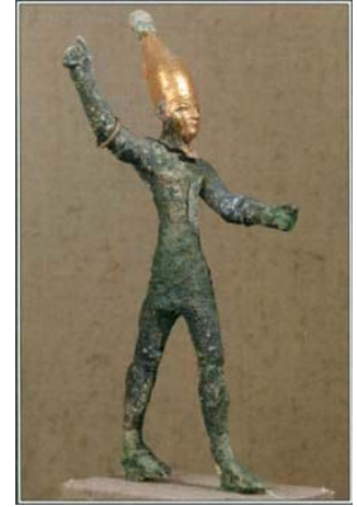
Baal, one of the most widely worshiped gods in ancient Canaan, was associated with fertility and rain. His cult spread to other people in the ancient Near East, including the Egyptians, Babylonians, and Assyrians. This statue of Baal dates from the 1300s B.C.

In actuality, idolatry is much more apt to arise out of the psychological needs of idol worshippers than from an intellectual mistake. Idolatry allows its adherents to create and observe, in the guise of a religion, a system of rituals and practices that satisfy their primitive urges and address their insecurities. Even when these pagan religions call upon their adherents to make sacrifices, there is a simultaneous satisfaction of deep primitive urges. Often this attraction is so subtle that the worshippers, unaccustomed to self-examination, are unaware of its insidious nature.