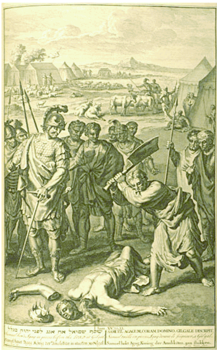
The prophet Samuel killing Agag by G-d's word

Society must be secure from evil for it to function properly - as a haven for Torah study and practice. This applies to both Jew and Gentile, as there is but one Torah system for both - although various laws apply to just the Gentile, just the servant, just the woman, just the Levite and just the Israelite. □