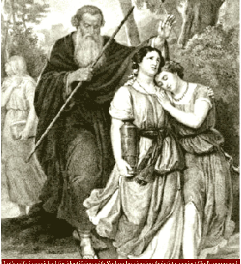
ot's wife is punished for identifying with Sodom by viewing their fate, against God's command